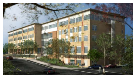
Social & Behavioral Sciences Gateway Building

Math 2A-B, 7 is recommended for anyone considering graduate school.