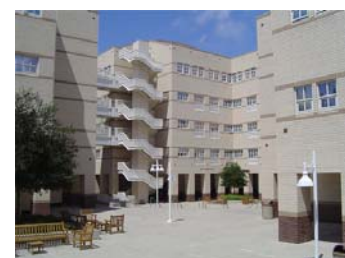
Social Science Plaza